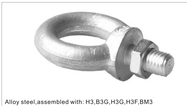
Alloy steel, assembled with: H3, B3G, H3G, H3F, BM3

Matched with S type load cells, suitable for hybrid scales, crane scales, packaging scales and hopper scales.